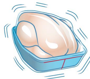
Transversal end seal

Bolfresh® BCF packing is hermetic. The seals are thin but resistant, to ensure a high level of cleanliness for shelves and products.